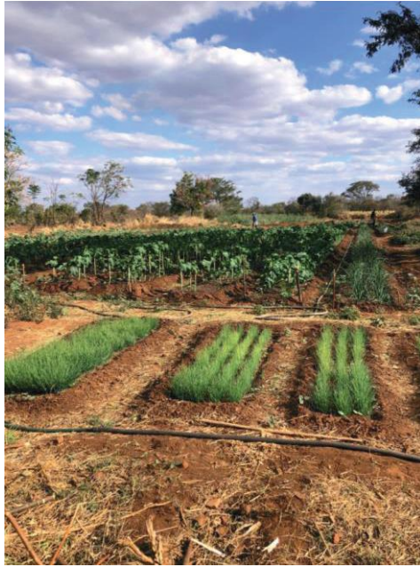
The Schools grow their own food. Vegetables at Nyathi High School