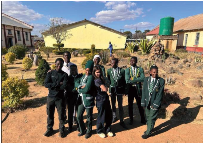
Boarding life. Thekwane High School